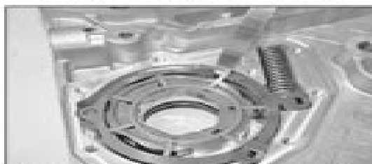
12.22b ...and radial clearances of the various components using a straight-edge and feeler blades