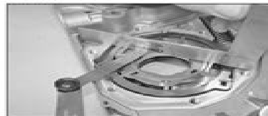
12.22a Measure the axial clearances...