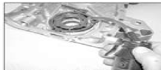
12.23 Thoroughly lubricate the pump internal components with clean engine oil, then refit the pump cover