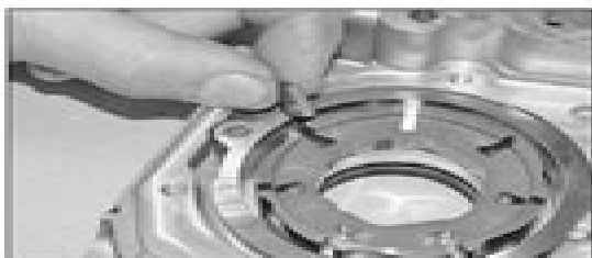
12.18 Locate the seven oil pump vanes into the slots in the vane rotor

are fitted with the slight scuff marks, caused by the vane rings, facing the vane rotor (see illustration).