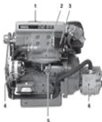
Co-55 A/B with reverse M/CCL