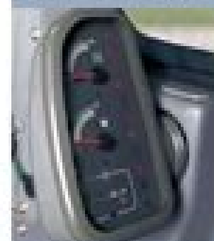
Instrument panel set at angle