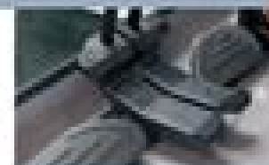
Adjustable power-assist foot pedals

The aircon system features a gas duct mixing freely to open and provide fresh. There's also heated mirrors and heated air conditioning with the ability for excellent cooling of the cab. A standard radio/cassette player with two speakers increases comfort. Power windows, radio and heater dramatically reduce noise levels in and out of the cab. Operate all operations without fatigue while those working nearby will appreciate a quieter environment.