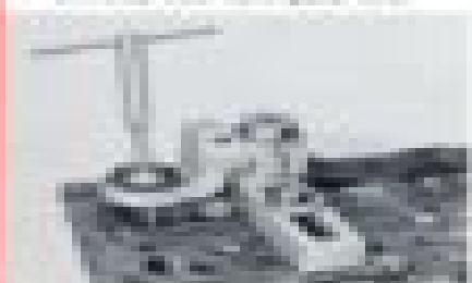
FIG. 3. The H. O. Lee valve guide reaming tool is designed to remove any metal excess which flows valve guides last in part of the cylinder head. These tools can be used to install oversize stem valves or replaceable valve guides.