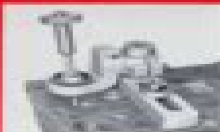
FIG. 1. The H. O. Lee valve guide reaming tool is designed to remove any metal excess which flows valve guides last in part of the cylinder head. These tools can be used to install oversize stem valves or replaceable valve guides.