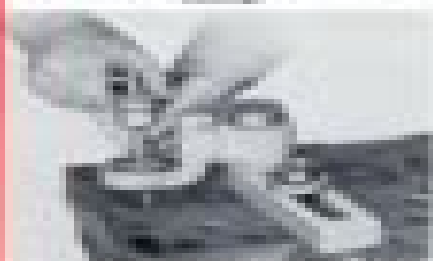
FIG. 2. The H. O. Lee valve guide reaming tool is designed to remove any metal excess which flows valve guides last in part of the cylinder head. These tools can be used to install oversize stem valves or replaceable valve guides.