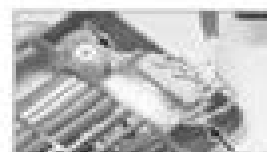
2-12: Radiator assembly (top view of the radiator)