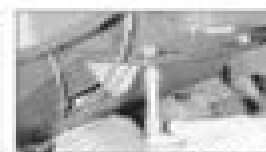
2-13: Radiator assembly (side view of the radiator)