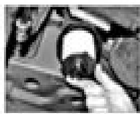
10.10g Loosen the new filter in the housing and push it up until it engages with the retaining cap.