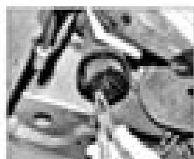
10.10f Using a screw, push the old filter from the housing.