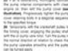
10.10i Secure the cover of pump cover into the side of the valve cover.

10.10.19 Check the oil level with a dipstick or pump, screen.