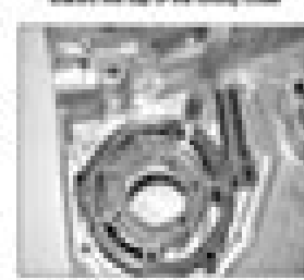
10.10n Fit a new crankshaft oil seal to the timing cover as described in Section 11.