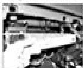
10.10b Then remove the filter from the housing.