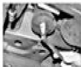
10.10c Loosen the fuel filter base.