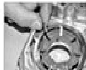
10.10i Secure the cover of pump cover into the side of the valve cover.

see them with the right-hand nut, secured by the cone rings, facing the valve side (see Illustration).