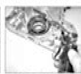
10.10o Tighten the timing chain and cover to the engine as described in Section 6.