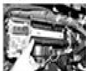
10.10a Remove the retaining bracket and open the fuel filter housing cover.

13 Tighten the filter base and tighten it to the