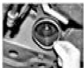
10.10h Fit a new sealing ring to the filter housing.