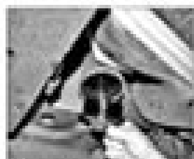
10.10d ...and remove it from the housing.