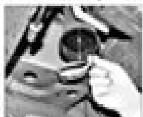
10.10e Remove the housing ring from the filter housing.