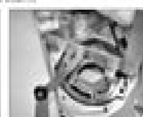
10.10m Measure the end and side dimensions of the pump components using a straight edge and feeler gauge.