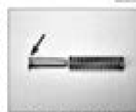
10.10l Ensure that the oil side of the oil pump side oil head is facing toward the top of the timing cover.