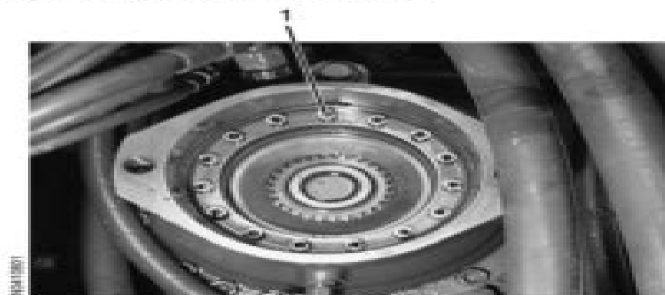
Figure 364 Coil spring 1 Coil spring