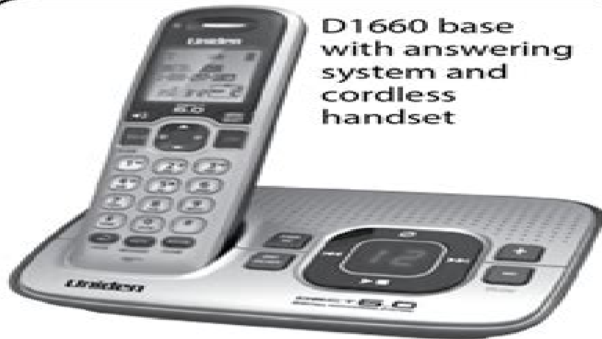
D1660 base with answering system and cordless handset