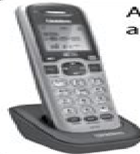
Accessory handset and charger