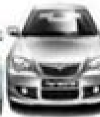
PERSONA 1.5 & BELOW