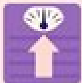
Weight gain Slowed metabolism

Usually occurs between 45 - 55 years old