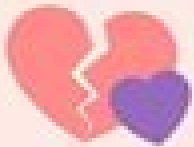
Loss Of Libido