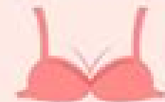
Loss Of Breast Fullness