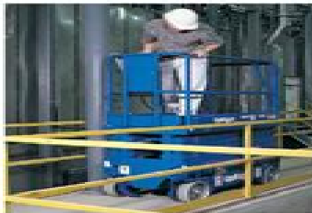
Compact dimensions and tight turning radius provides excellent manoeuvrability

Specifications subject to change without notice. Photos and diagrams in this brochure are for promotional purposes only. Refer to appropriate UpRight operations manual for detailed instructions on the proper use and maintenance.