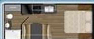
PROWLER LYNX 18 LX