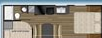
PROWLER LYNX 22 LX