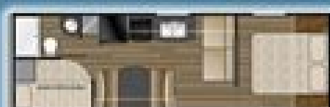
PROWLER LYNX 25 LX