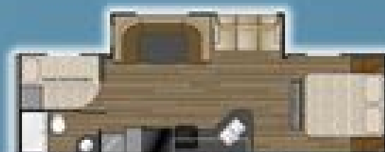
PROWLER LYNX 38S LX