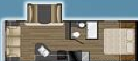
PROWLER LYNX 36 LX