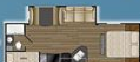
PROWLER LYNX 24S LX