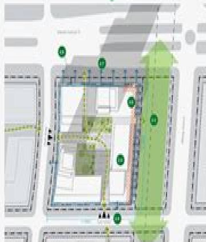
Figure 1. Histogram of frequency of responses to the first question.