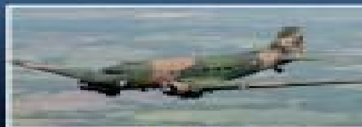
AC-47 THE FIRST GUNSHIP