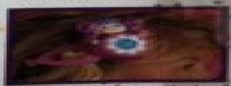
It's a pretty brooch too!