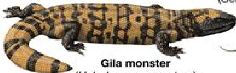
Gila monster ( Heloderma suspectum )