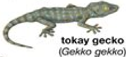
tokay gecko ( Gekko gekko )