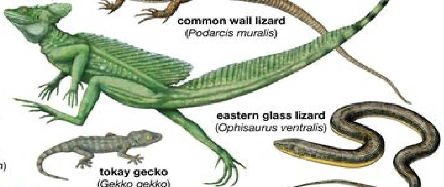
eastern glass lizard ( Ophisaurus ventralis )