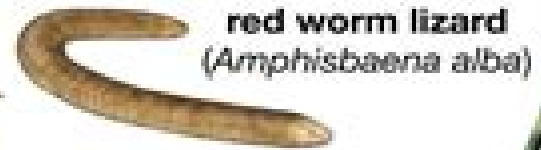
red worm lizard ( Amphisbaena alba )