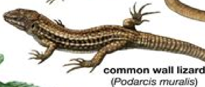
common wall lizard ( Podarcis muralis )