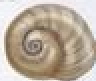
Shark Eye (E)

Tegula funiculata To 1 in. (2 cm) Rounded, black shell with a smooth apex.