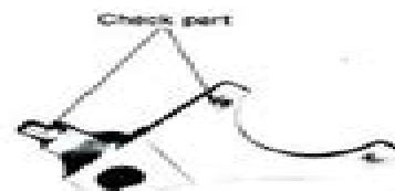
Fig. 6-2-32 Checking gear shifting fork end

If the gear shifting fork should be burnt or worn on its contact surface to the gear. Replace with new one. Besides check the gear for burning and scratch. If faulty, replace.