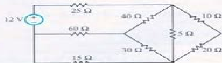
Figure P1.8: Circuit for Problem 1.8.