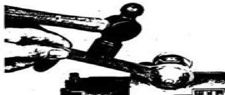
Fig. 9 Loosening Piston Hole Plugs (T-72722)

the advance cam pin must be removed before the plug, piston, spring, etc., will be removed as an assembly. Slide the piston out of the plug (do not turn piston inside of plug). Remove the retaining ring from the piston and remove spring and adjusting screw.