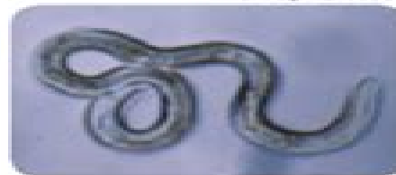
Vinegar eel (2 mm in length)