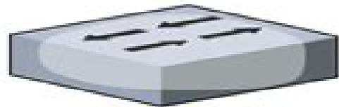
Out-of-Band Management Switch

Management LAN Ports Connect to Out-of-Band Management Switch