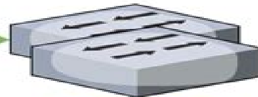
Redundant Switches Connect to Local Network and Connect Nodes Together