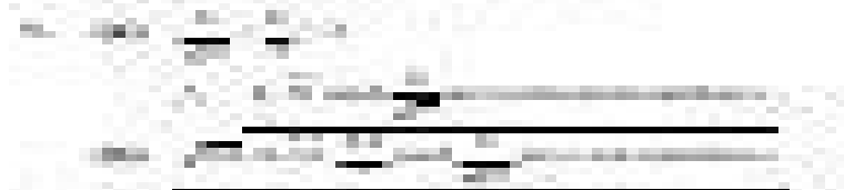
Figure 1: Numerical results of the proposed algorithm.