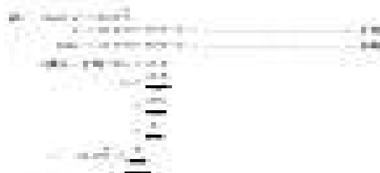
Figure 2: Numerical results of the proposed algorithm.