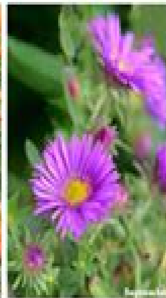
New England Aster