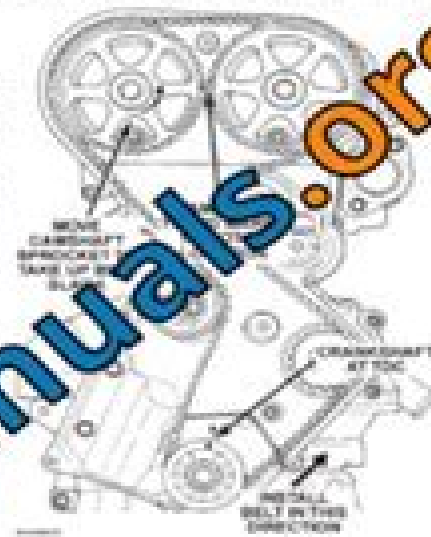
Fig. 23 Timing Belt—Installation