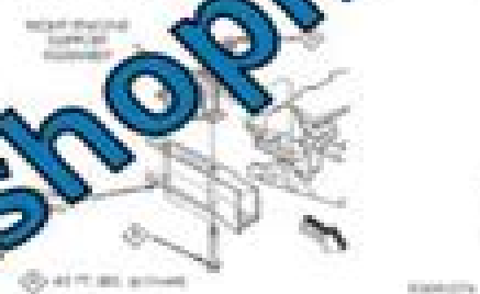
Fig. 22 Engine Mounting—Right Side