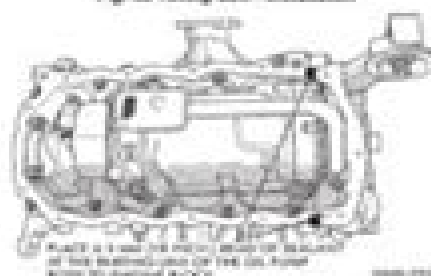
Fig. 24 Oil Pan Sealing