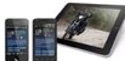
Stream to mobile devices