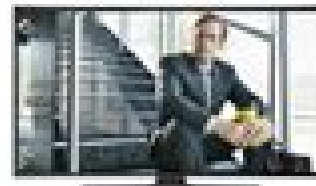
Bedroom #2: TiVo Roamio®