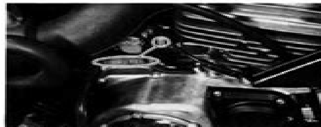
1. Engine serial number

The engine serial number is stamped into the elevated part of the right rear section of the engine.