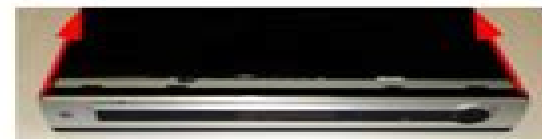
Figure 3 (above) Front View