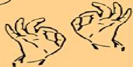
"The Style Grab" add a wink, OK sign, or finger guns for style points