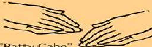
"Patty Cake" throwback to your childhood with classic patty cake