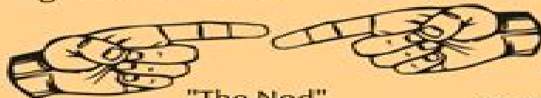
"The Nod" show some appreciation for your partner