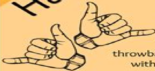
"The Chill" hang loose or rock on