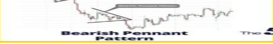
Bearish Pennant Pattern