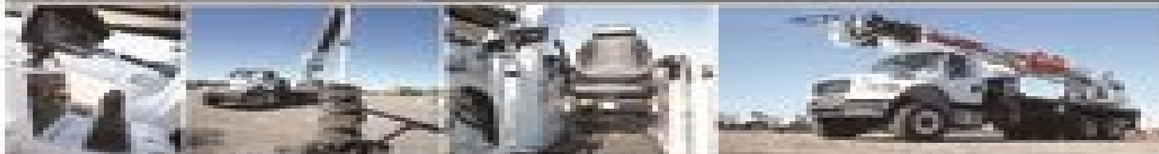
FRONT SIDE VIEW DIAGRAM