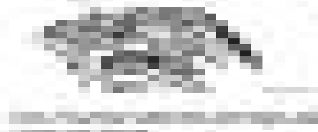
Figure 2: A black and white photograph of a person in a white lab coat, possibly a scientist or doctor, standing in a laboratory setting. The person is wearing a white lab coat over a dark shirt and is looking down at something in their hands. The background is slightly blurred, showing what appears to be laboratory equipment or shelves.

Figure 1: A black and white photograph of a person in a white lab coat, possibly a scientist or doctor, standing in a laboratory setting. The person is wearing a white lab coat over a dark shirt and is looking down at something in their hands. The background is slightly blurred, showing what appears to be laboratory equipment or shelves.