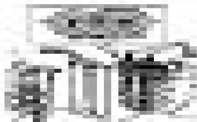
Figure 1: A black and white photograph of a person in a white lab coat, possibly a scientist or doctor, standing in a laboratory setting. The person is wearing a white lab coat over a dark shirt and is looking down at something in their hands. The background is slightly blurred, showing what appears to be laboratory equipment or shelves.

Figure 2: A black and white photograph of a person in a white lab coat, possibly a scientist or doctor, standing in a laboratory setting. The person is wearing a white lab coat over a dark shirt and is looking down at something in their hands. The background is slightly blurred, showing what appears to be laboratory equipment or shelves.