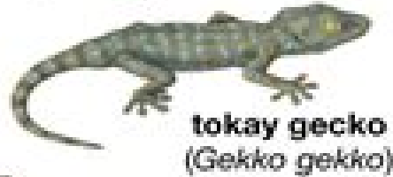
tokay gecko ( Gekko gekko )