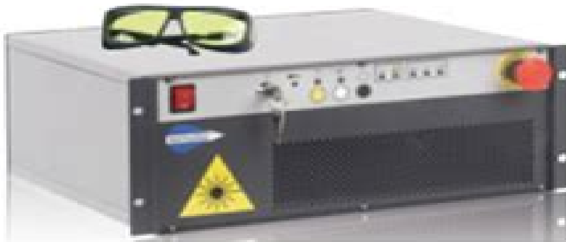
Technifor Fiber Laser TF430