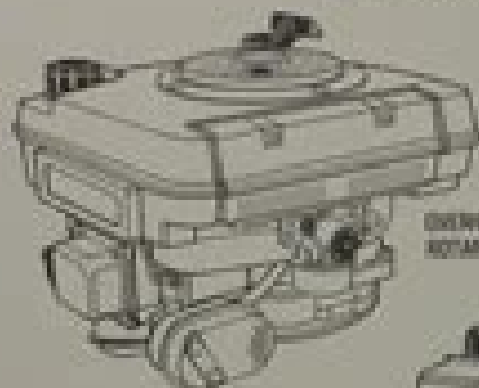
OVERHEAD VALVE ROTARY MOTOR