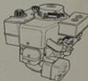
VERTICAL OVERHEAD VALVE MOTOR ENGINE