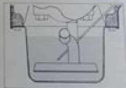
Oil Pan (Check Oil Level)