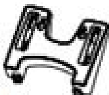
1 x Phone Stand