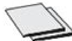
1 x Quick Installation Guide / 1 x GPL License