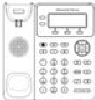
1 x Phone Main Case