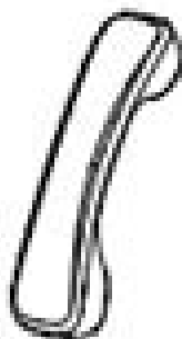
1 x Handset