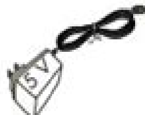
1 x 5V Power Adapter