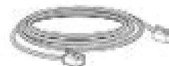
1 x Ethernet Cable