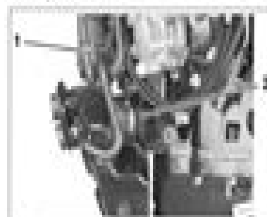
1 Overflow hose 2 Muffler clamps

Disconnect water overflow hose from vapor separator. Remove clamps and muffler assembly from rear of powerhead.