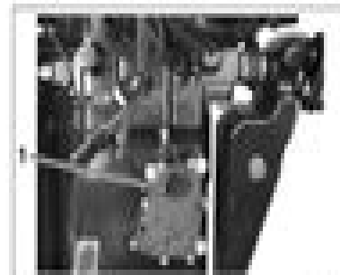
1 Exhaust actuator

Disconnect electrical harness from exhaust valve actuator (V4 models). It is not necessary to remove actuator from exhaust housing.