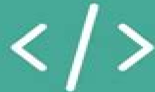
Software skills tests