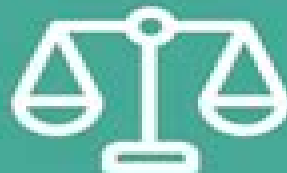
Situational judgment assessments