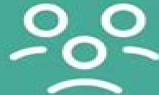
Personality and culture assessments