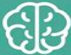
Cognitive ability tests