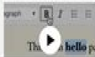
The hello page