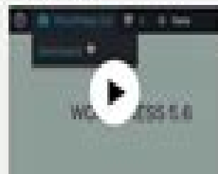
The Admin Bar