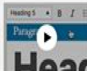
Add A Paragraph