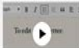
To edit content