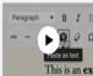
Write From Word