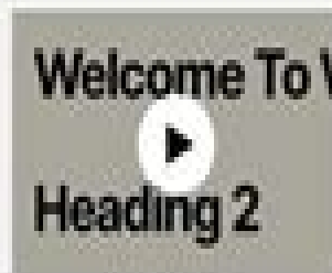
Add A Heading