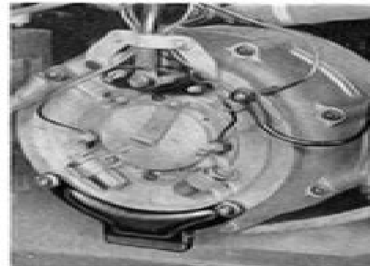
Bild 85. Gummiralle mit Nr. 436324-0 für Typ F 8

Ist durch unsachgemäßes Schalten bereits ein Verschleiß der Getriebeteile eingetreten, d. h. zeigt sich beim Fahren bereits ein Herausspringen des 1. Ganges, so muß der Vorgelege-Räderblock, wenn notwendig auch der Schaltstift, ausgewechselt werden. Der nachträgliche Einbau der Motorabstützung allein kann in diesem Falle das Herausspringen des Ganges nicht mehr verhindern.