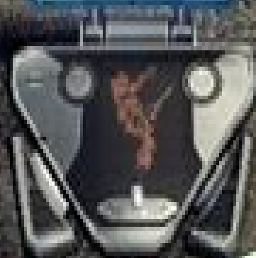
MatterMaster 1 (L)