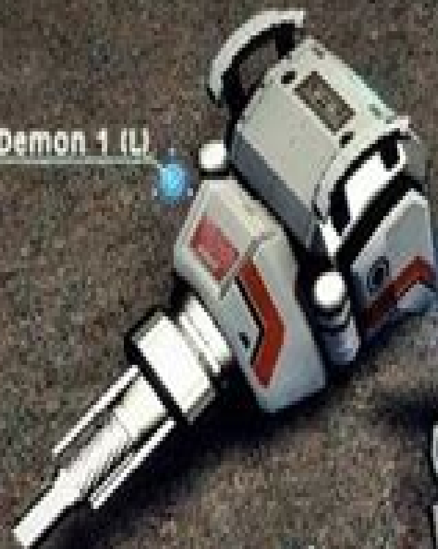
Dirt Demon 1 (L)