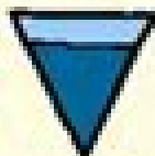
The Inverted Pyramid Newspaper Article