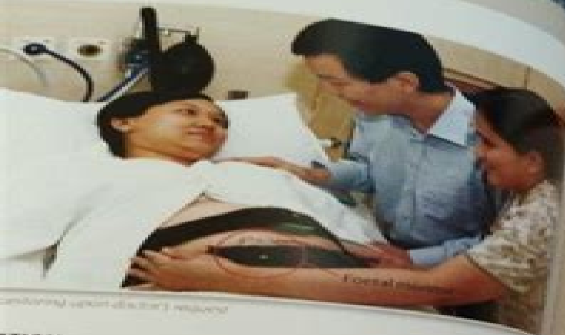
Monitoring upon doctor's request