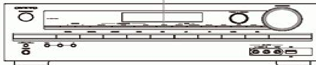
Black and Silver models

North American and Taiwanese models → "DM502" European, Australian and Asian models → "TD PTG TP"