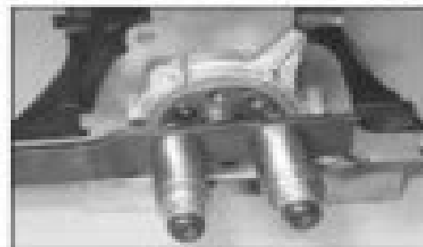
10.12a. Home-made tool for holding the crankshaft stationary while the crankshaft pulley bolt is being loosened (engine removed for clarity).

Note: The removal of the crankshaft bolt means that the crankshaft is no longer clamped to the engine block. To prevent the crankshaft from rotating, use a special numbered (132150 (M20 engine) or 112170 (M40 engine)) for this purpose. If this tool cannot be bought or borrowed, check with a tool-shed or motor factors for a tool capable of doing the job. Note that the tool number 132170 bolts on the rear of the cylinder head and engages with the flywheel ring gear, so it will only be possible to use this tool if the gearbox has been removed, or if the engine is out of the vehicle (see illustrations). On