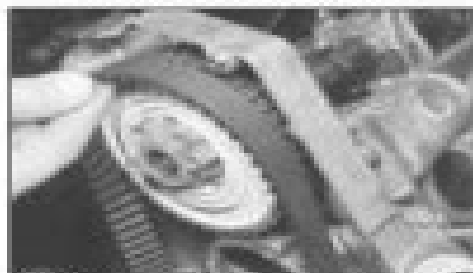
10.9b Removing the timing belt from the camshaft sprocket on the M40 engine.