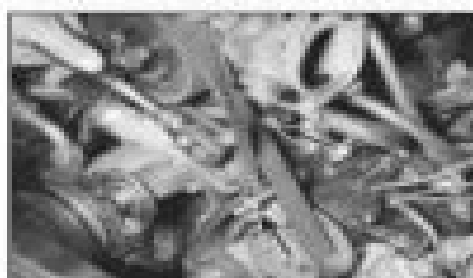
10.8 Loosen the idler pulley bolts (arrowed) to relieve the tension on the timing belt so it can be removed.