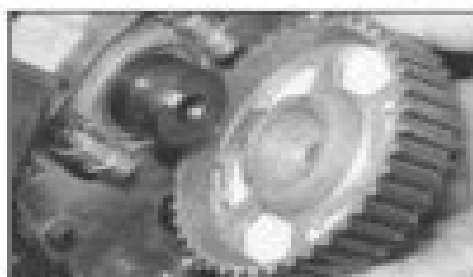
10.10 Removing the camshaft sprocket on the M40 engine.