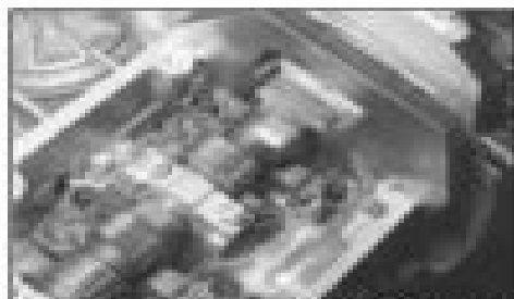
10.11b. The BMW camshaft-holding tool in position on the M40 engine.

10 If it's necessary to remove the camshaft or the intermediate-shaft sprocket, remove the sprocket bolt while holding the sprocket to prevent it from moving. To hold the sprocket, wrap it with a piece of an old timing belt (dotted line engaging the sprocket tooth) or