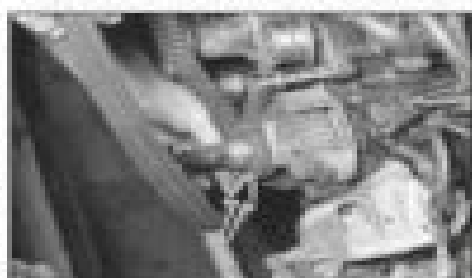
10.8a. When reinstalling the timing belt on models with a two-piece crankshaft hub, it's a tight fit to remove it around the hub, but it's a lot easier than removing the crankshaft hub assembly, which is secured by a very tight bolt.

alignment mark on the camshaft sprocket and new timing-cover to ensure correct fitting.