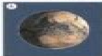
It is Mars.