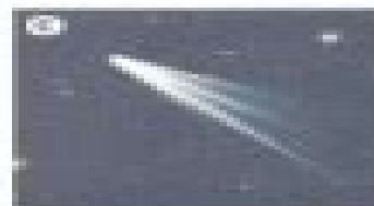
It is a comet.