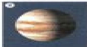
It is Jupiter.