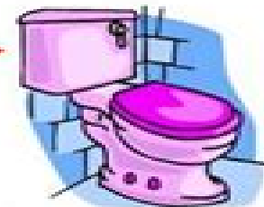
Domestic water use in Canada.

Home water use makes up a bout 5% of total water use worldwide.