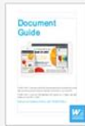
Document Guide.docx 2014-05-12 14:08