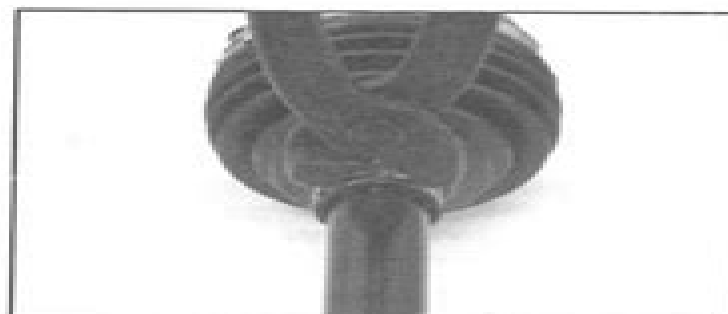
Axle Boot Clamp Tool PU-48951 or 8700226